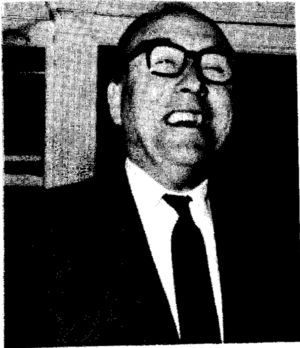
Jenkins— Tory Agent

So far these people have been allowed to cross the "class line" with impunity. Far from censuring and expelling them, the Wilson leadership and the Parliamentary Labour Party have given them a blank cheque to do what they want, by re-electing Jenkins as deputy leader and Houghton as Party chairman. This is not very surprising since the 69 are consistently carrying out the policies of the last Labour government. It was that administration which really started the ball of unemployment rolling, it was our Labour government which subordinated itself to the Stock Exchange and the big monopolies - attempting to introduce "In Place of Strife" and to enter the EEC; it was Wilson & Co who failed to mobilise the Labour movement and seize real power from the Tories. It was this abysmal record that enables the Labour marketeers to scab without fear of reprisals!