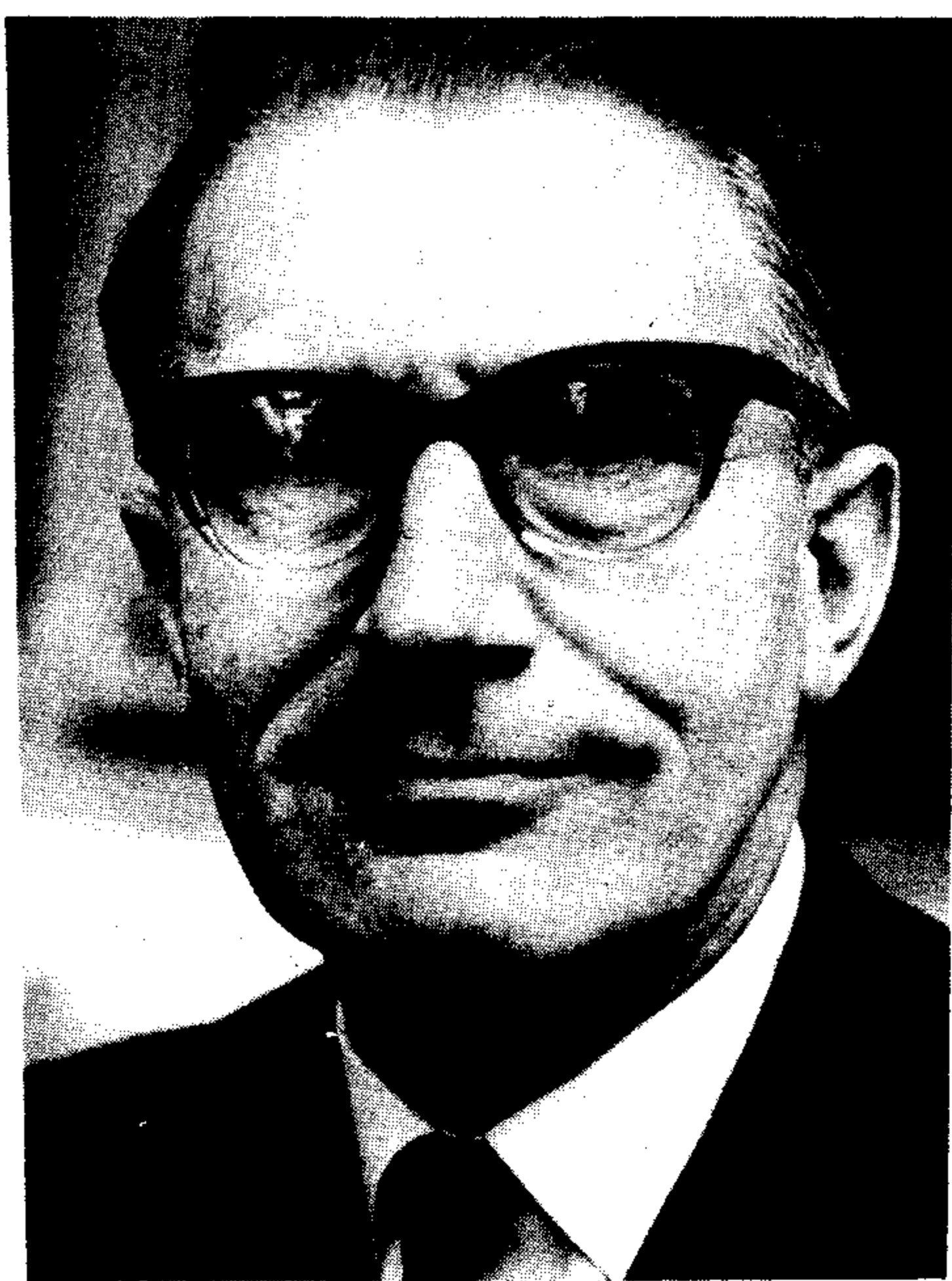
MAYHEW— Will his CLP ditch him?

The arch-renegade Mayhew in Woolwich; Taverne who defied his GMC in Lincoln, and various other Labour traitors, including Mason in Barnsley, are also being grilled.