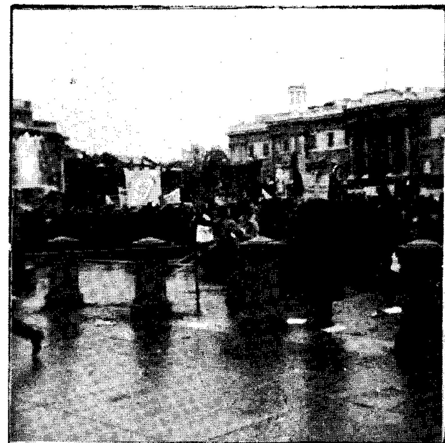
The marchers at the Square.